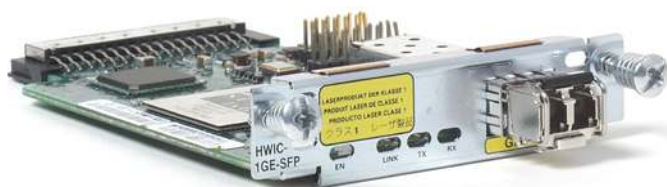
Figure 1. Cisco Gigabit Ethernet HWIC

Cisco IOS® Software provides enhanced capabilities such as quality of service (QoS), Multiprotocol Label Switching (MPLS), IP Security (IPSec), and Layer 3 VPNs. Since this is a true routed port card, the user can configure an IP address directly on the HWIC-1GE-SFP interface and does not have to configure the port for VLAN trunking as is done in Switched Virtual Interface (SVI) configurations.