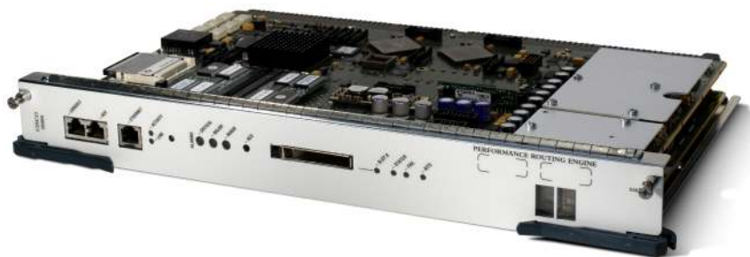
Figure 1. Cisco 10000 Series Performance Routing Engine 3

Designed to meet new requirements from service providers for high-capacity aggregation with sophisticated IP services, the Cisco 10000 Series PRE-3 uses the latest generation of the Cisco patented Parallel Express Forwarding (PXF) technology. PXF is a parallel multiprocessor architecture that helps enable deployment of multiple IP services while maintaining peak performance throughput. The PRE-3 also introduces the Hierarchical Queuing Framework (HQF) to the Cisco 10000 Series Routers. The HQF implementation on the PRE-3 allows three levels (class, logical, and physical) of scheduling to apply queuing and shaping (see Figure 2).