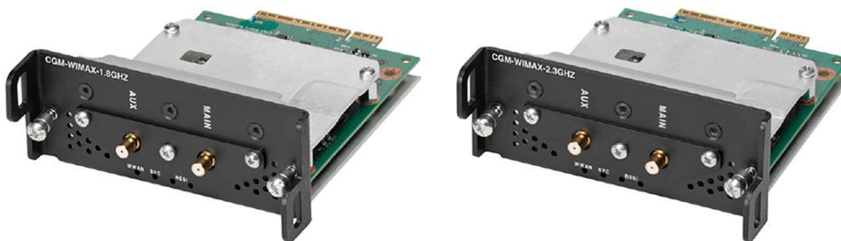
Figure 1. Cisco Connected Grid WiMAX Modules

There are four SKUs in the WiMAX Module Family, providing utilities with a choice of flexible spectrum offerings in the licensed, lightly licensed, and unlicensed frequencies, as defined in Table 1 below.