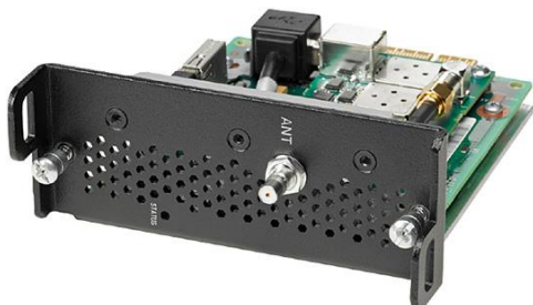
Figure 1. Cisco Connected Grid WPAN Module

The Cisco IEEE 802.15.4g/e-compliant WPAN Connected Grid Module for CGR 1000 routers gives utilities highly secure IPv6-based, over-the-air network connectivity. These modules are ideal for high-scale deployments to smart meters, distribution sensors, distribution automation devices, gateways (such as the Cisco 500 Series WPAN Industrial Routers [IR500]), and other endpoints. They are also suited for use in multi-hop mesh networks and long-reach solutions. Figure 1 displays a Cisco Connected Grid WPAN Module.