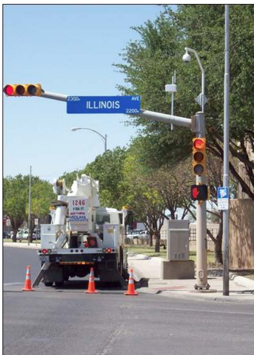
Figure 2. Signal Controller in Midland, Texas