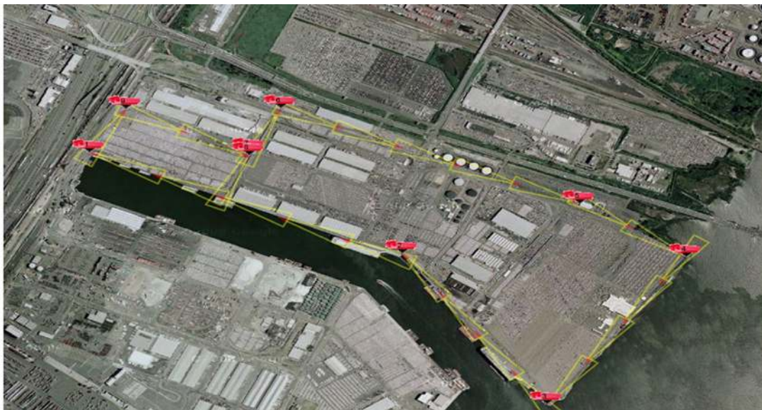
Figure 3. A 4.6-Mile Seaport Perimeter Security Design, Created Using the SightSurvey Online Tool from SightLogix

Video surveillance cameras from SightLogix, a Cisco partner, georegister all video so that personnel know precisely where an event occurred, either to prevent a crime or to support later investigation. You can protect perimeters and assets at a low cost by connecting wired or wireless video surveillance cameras at existing fencelines or anywhere you cannot or do not want to erect a fence. The cameras operate reliably in any outdoor environment, 24 hours a day, providing reliable automation over very large areas (Figure 2). Automated monitoring frees up personnel to make discretionary decisions based on actionable information.