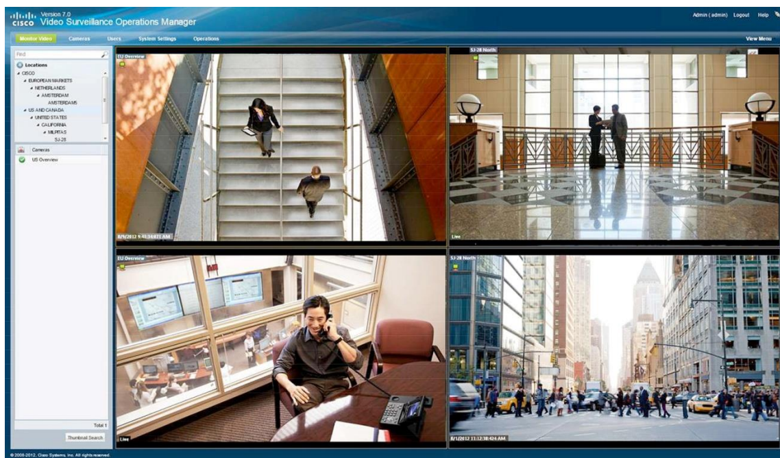
Figure 1. Cisco Video Surveillance Operations Manager

Quickly and effectively, configure and manage video throughout your enterprise with the Cisco Video Surveillance Operations Manager (Figure 1). It provides a highly secure web portal to configure, manage, display, and control video in an IP network, and allows you to easily manage a large number of security assets and users, including media servers, cameras, encoders, and event sources.