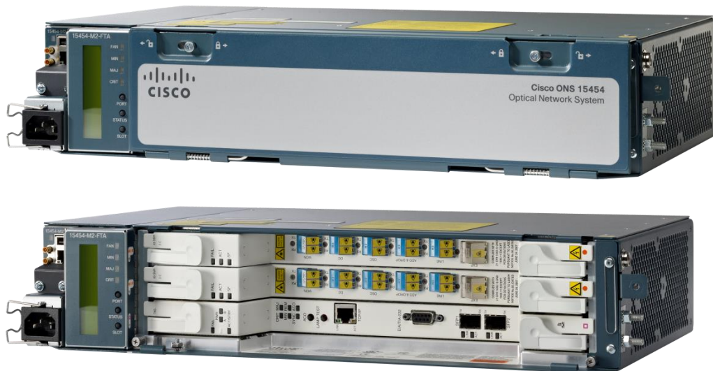
Figure 1. Cisco ONS 15454 M2 Multiservice Transport Platform

The Cisco® ONS 15454 M2 Multiservice Transport Platform (MSTP) sets the industry benchmark for compact, simple, fast, and intelligent dense wavelength-division multiplexing (DWDM) solutions. Its compact form, simplicity, and low power consumption reduce capital expenditures (CapEx) and operating expenses (OpEx). The Cisco ONS 15454 M2 (Figure 1) is compatible with the existing portfolio of Cisco ONS 15454 MSTP line cards, thereby offering a multitude of MSTP applications in a smaller footprint. From access aggregation solutions with the integrated AC power module to core applications such as optical line amplifiers with an optical service channel (OSC), the flexible Cisco ONS 15454 M2 supports a broad range of solutions.