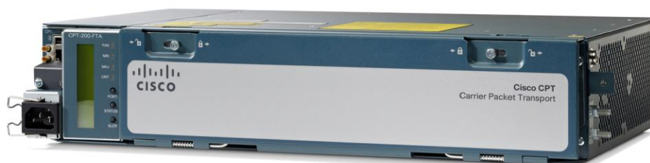
Figure 1. Cisco CPT 200 Carrier Packet Transport (with front cover (left), without front cover (right))

The CPT platform has great revenue potential for service providers by providing TDM like Ethernet Private lines as well as multipoint capabilities for Business, Residential, Mobile Backhaul, Data Center, and Video Services. These next generation of services can be readily deployed at low operational costs using the Cisco Transport Controller (CTC) and Cisco PRIME that allow fast and simple network turn up, A to Z provisioning and OAM features.