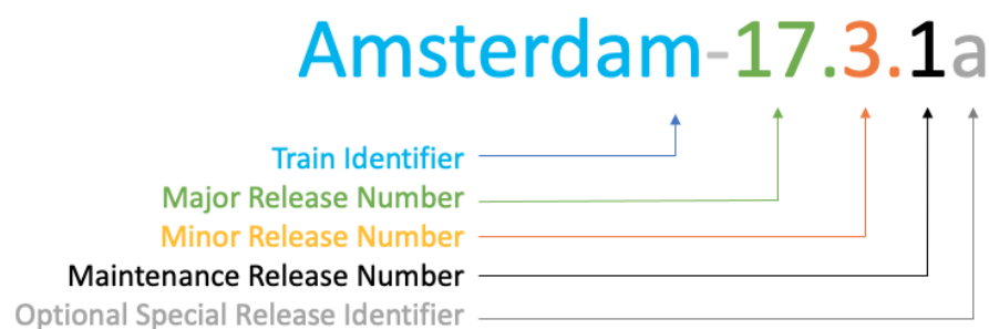
Figure 1. Cisco IOS XE Software Release Versioning

The Cisco IOS XE 16.x.x and 17.x.x Software releases are time-based, each with a fixed release date. The schedule specifies 3 individual software releases per year at 4 month intervals.