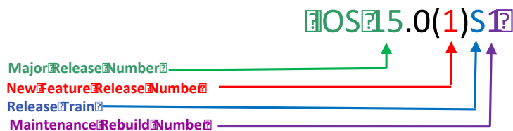
Figure 1. Cisco IOS 15S Software Release Versioning

Cisco IOS 15S Software releases are time-based, each with a fixed release date. The schedule specifies three individual software releases per year at four month intervals.