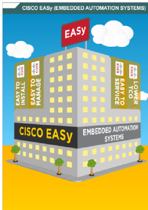
Figure 1. EASy Can Help Simplify Network Management Deployments

The ISR G2 has an enforced licensing model that requires installation of permanent licenses for new installations and after device replacement. There are a few methods of installing licenses, including an external tool or a Cisco IOS® Software local tool, but both methods are tedious and require IP connectivity to Cisco to install the licenses. Using the license installer in Cisco IOS Software requires entering 16 pieces of information plus selecting the license you intend to install. This is an issue with many service providers who may or may not have Internet access in their staging area or who are installing multiple licenses on many devices. See Figure 1.