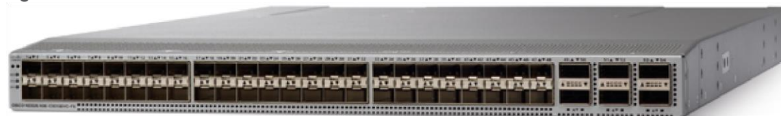
Figure 3. Cisco Nexus 93180YC-FX Switch

Table 2 lists the Cisco Nexus 9300-FX platform switch specifications.