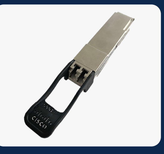
Figure 1. QSFP-100G-ZR4

The QSFP-100G-ZR4-S enables 100Gb at distances reaching 80km to connecting: wireless access locations to core networks, distant enterprise locations to each other, widely separated regional data centers together, or remote service provider buildings to central offices.