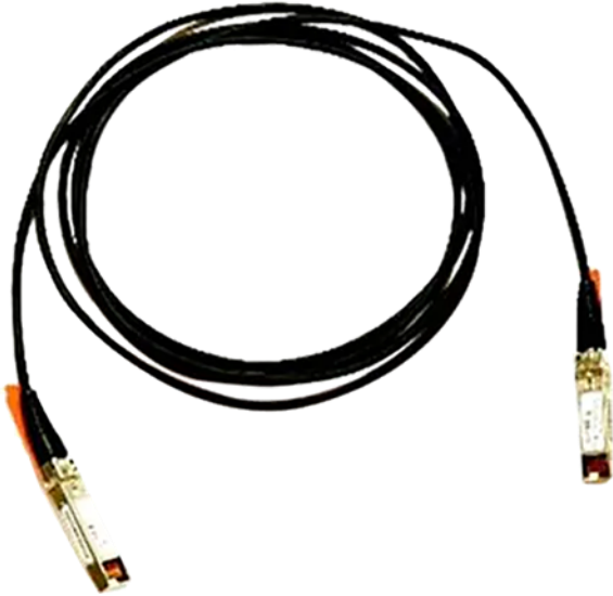
Figure 4. Cisco direct-attach twinax copper cable assembly with SFP+ connectors

Cisco SFP+ Copper Twinax (Figure 4) direct-attach cables are suitable for very short distances and offer a cost-effective way to connect within racks and across adjacent racks. Cisco offers passive Twinax cables in lengths of 1, 1.5, 2, 2.5, 3, 4 and 5 meters, and active Twinax cables in lengths of 7 and 10 meters.