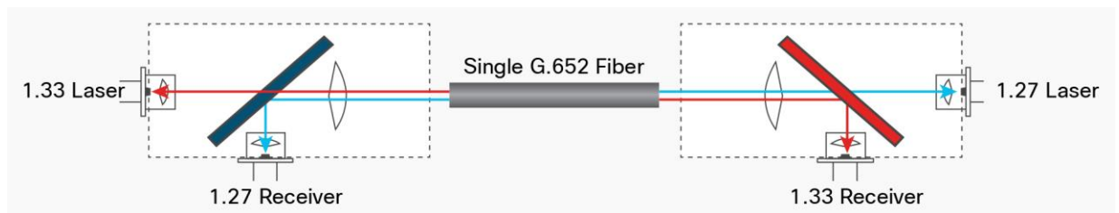
Figure 2. Bidirectional transmission of a single strand of SMF

The SFP-10G-BXD-I and SFP-10G-BXU-I SFPs also support Digital Optical Monitoring (DOM) functions according to the industry-standard SFF-8472 Multisource Agreement (MSA). This feature gives the end user the ability to monitor real-time parameters of the SFP, such as optical output power, optical input power, temperature, laser bias current, and transceiver supply voltage.