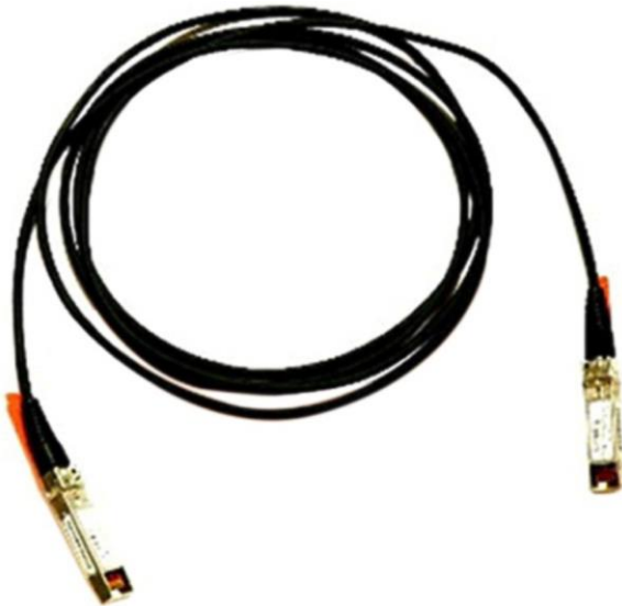
Figure 3. Cisco direct-attach twinax copper cable assembly with SFP+ connectors

Cisco SFP+ Copper Twinax (Figure 3) direct-attach cables are suitable for very short distances and offer a cost-effective way to connect within racks and across adjacent racks. Cisco offers passive Twinax cables in lengths of 1, 1.5, 2, 2.5, 3 and 5 meters, and active Twinax cables in lengths of 7 and 10 meters.