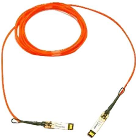
Figure 5. Cisco direct-attach active optical cables with SFP+ connectors

Cisco SFP+ Active Optical Cables (Figure 5) are direct-attach fiber assemblies with SFP+ connectors. They are suitable for very short distances and offer a cost-effective way to connect within racks and across adjacent racks. Cisco offers Active Optical Cables in lengths of 1, 2, 3, 5, 7, and 10 meters.