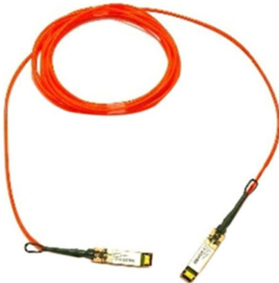
Figure 4. Cisco direct-attach active optical cables with SFP+ connectors