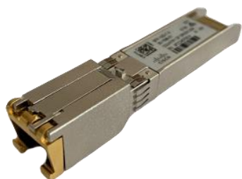
Figure 2. Cisco SFP+ 10GBASE-T module with RJ-45 connector

The Cisco 10GBASE-T module (Figure 2) offers connectivity options at the following data rates: 100M/1G/10Gbps. It has the SFP+ form factor and an RJ-45 interface so that CAT5e/CAT6A/CAT7 cables can be used to connect to end points with embedded 10GBASE-T ports. They are suitable for distances up to 30 meters and offers a cost-effective way to connect within racks and across adjacent racks.