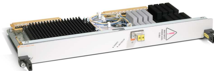
Figure 1. Cisco 1-Port 10GE Tunable WDM-PHY Interface SPA

The 10GE Tunable WDM-PHY SPA is part of the Cisco IP-over-DWDM solution portfolio. Service providers benefit from IP-over-DWDM integration through faster service provisioning, increased reliability, and simplified network management. Integrated DWDM transponders simplify the network by reducing the number of network elements and also scale at a lower total cost to reduce bandwidth cost. Finally, IP-over-DWDM solutions allow service providers to more cost-effectively use the rich QoS and IP intelligence of Cisco routers in their transport networks.