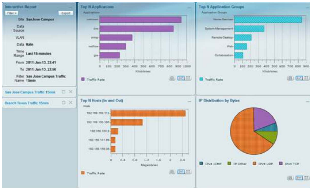
Figure 2. Cisco NAM Traffic Summary Dashboard

The Cisco Catalyst 6500 Series and Cisco 7600 Series NAM includes a snappy graphical user interface (GUI) with dashboards (Figure 2) to give you an immediate view of network performance and workflows to help you simplify problem detection and resolution. It also uses a rich set of Cisco infrastructure features as sources of data, such as Switched Port Analyzer (SPAN) packet data and NetFlow, giving you more ways to see and understand what's happening on your network. And, with an array of vital features and functions, such as a new embedded Performance Database, which preserves historical data, allowing you to understand what happened in the past when a network event that affected performance occurred, the Cisco NAM makes it easier than ever before to manage and improve network and application performance anytime and anywhere.