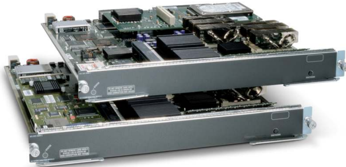
Figure 1. Cisco Catalyst 6500 Series and Cisco 7600 Series Network Analysis Modules, NAM-1 and NAM-2

As a member of the Cisco NAM family of products, the Cisco Catalyst 6500 Series and Cisco 7600 Series NAM (Figure 1) delivers granular traffic analysis, rich application performance metrics, comprehensive voice analytics, and deep insightful packet captures to help you manage and improve the operational effectiveness of Cisco Borderless Networks and the Cisco data center. Its unique design combines embedded data collection and analysis capabilities with a remotely accessible, web-based management and reporting console, all of which reside on a single blade that is installed into the Cisco Catalyst 6500 Series Switch or the Cisco 7600 Series Router.