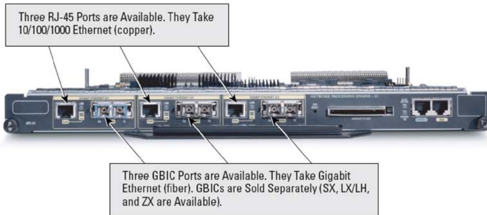
Figure 2. Cisco 7200 Series NPE-G1 Ports

Gigabit Ethernet ports: Three 10/100/1000 ports are available on the NPE-G1 (Figure 2). Either copper or fiber is available.