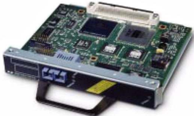
The Multichannel STM-1 Port Adapter