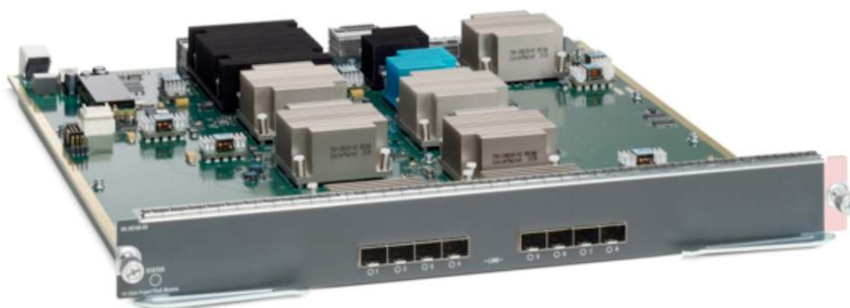
Figure 1. Cisco MDS 9000 10-Gbps 8-Port FCoE Module

Enterprise networks are growing rapidly, and data centers are struggling to manage power, cooling, and space. In response, enterprises are looking for ways to extend the life of existing data centers to get the most from their investments for years to come. The Cisco MDS 9000 10-Gbps 8-Port FCoE Module bridges the gap between the traditional Fibre Channel SAN and the evolution to FCoE. Enterprises can reduce capital expenditures (CapEx) and operating expenses (OpEx) in the data center by deploying FCoE while using the Cisco MDS 9000 10-Gbps 8-Port FCoE Module to protect their investment in existing Fibre Channel SANs and Fibre Channel-attached storage.