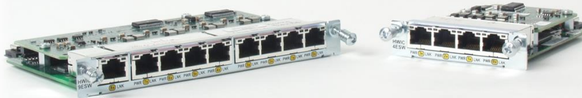
Figure 1. 9- and 4-Port Cisco EtherSwitch HWICs