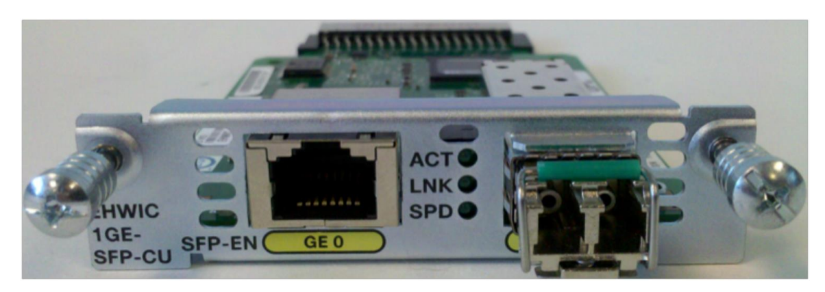
Figure 1. Cisco Gigabit Ethernet EHWIC-1GE-SFP-CU