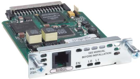
Figure 1. Cisco 4-Pair G.SHDSL EFM HWIC (HWIC-4SHDSL-E)