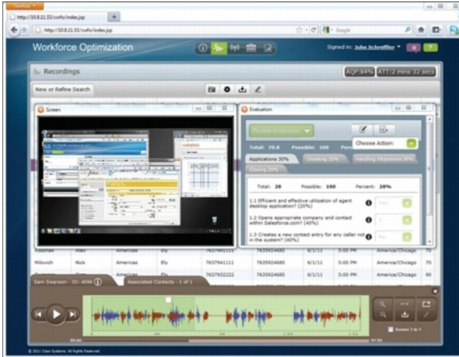
Figure 2. Cisco Unified Workforce Optimization Quality Management Contact Player