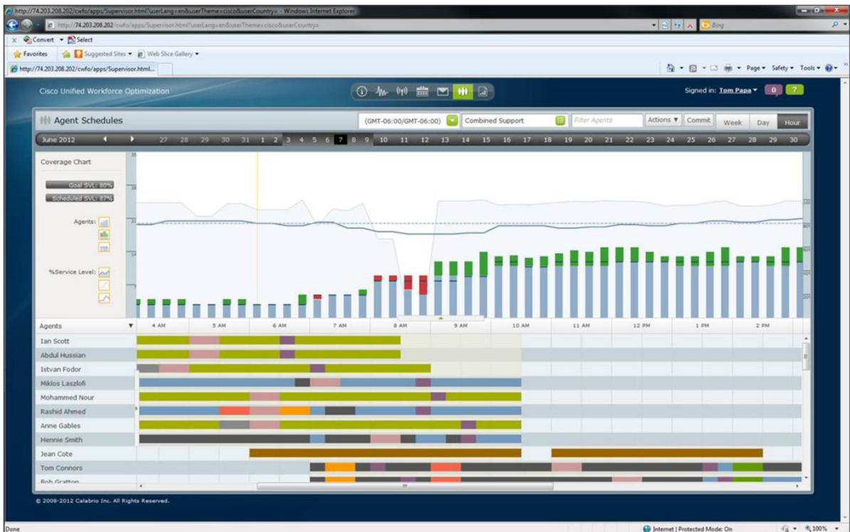
Figure 3. Workforce Management Agent Schedule View