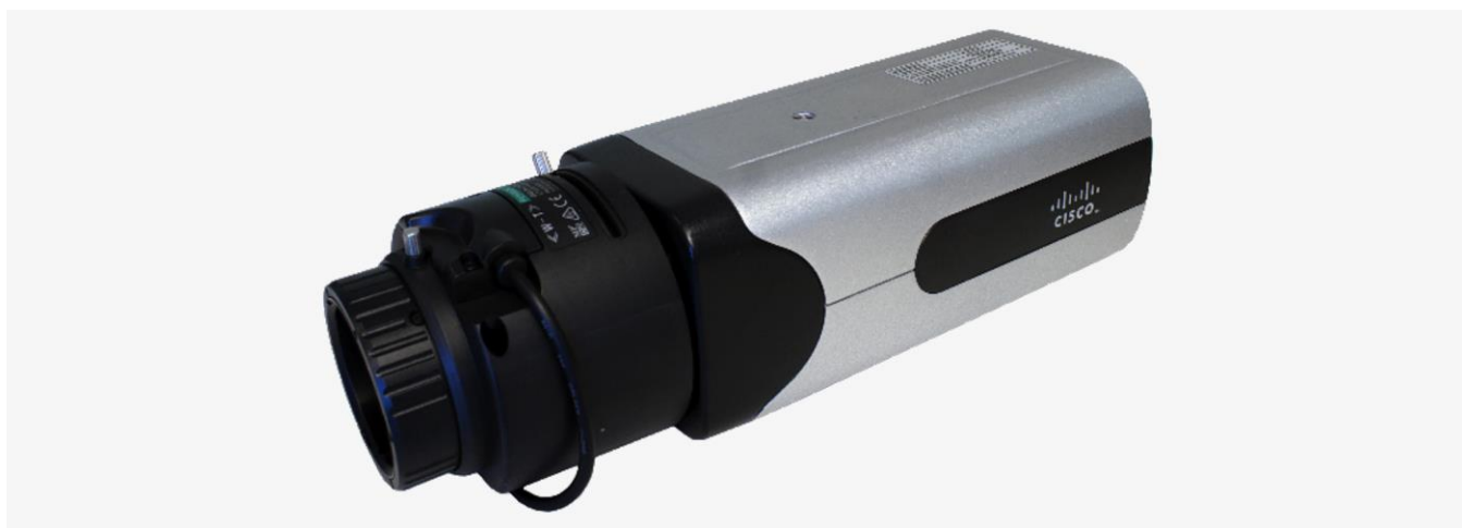
Figure 1. Cisco Video Surveillance 8000P IP Camera

The Cisco Video Surveillance 8000P IP Camera offers a variety of benefits, including: