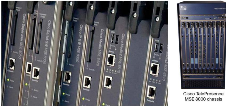
Cisco TelePresence MSE 8000 chassis