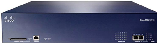
Figure 1. Cisco TelePresence MCU 4500 Series