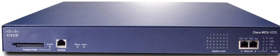
Figure 1. Cisco TelePresence MCU 4200 Series