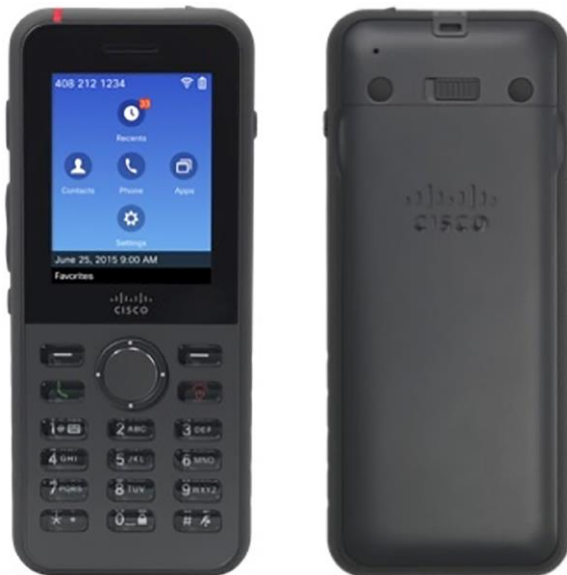
Figure 1. Cisco Wireless IP Phone 8821