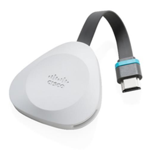
Figure 1. Cisco Webex Share

Cisco Webex Share complements the premium portfolio of Cisco Webex collaboration devices, enabling conference rooms and huddle spaces to offer the same Webex user experience as Cisco's video devices.