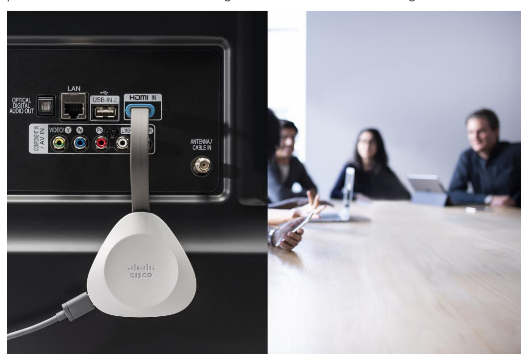
Figure 3. Webex Share installation

Cisco Webex Share is installed behind the screen (Figure 4). The package includes a cable management sticker that allows users to correctly position the device behind the display and to avoid mechanical stress on the HDMI port. The HDMI cable has been designed to sustain the device weight.