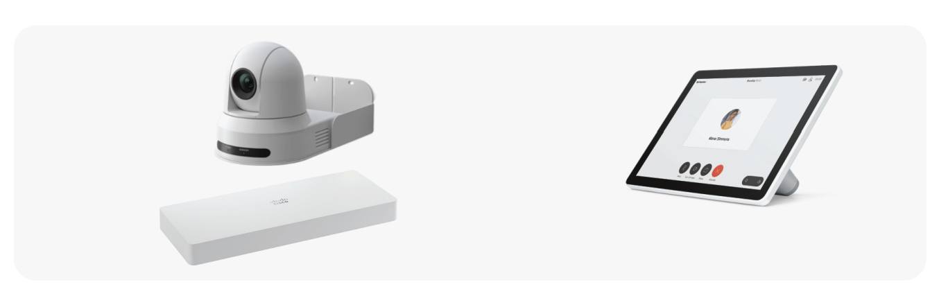
Figure 2. Default components of the Webex Room Kit Plus PTZ 4K bundle