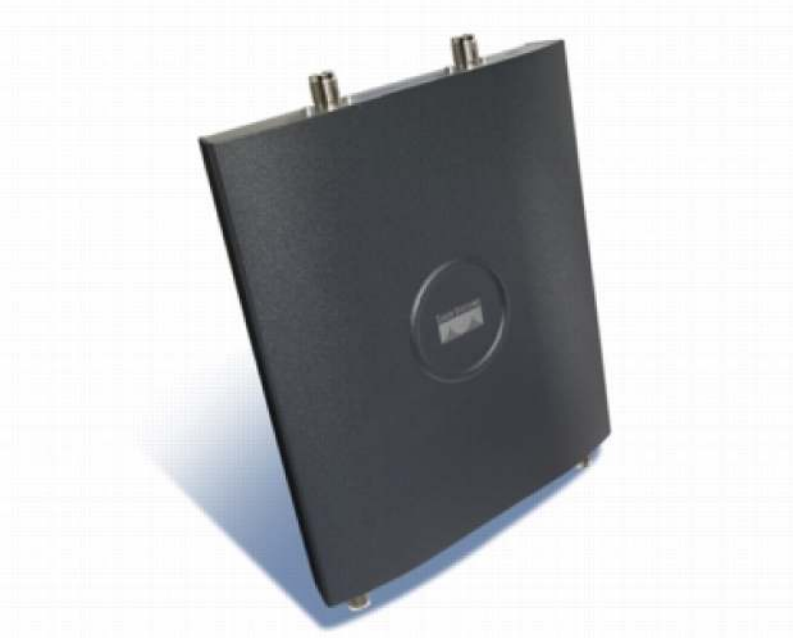
Figure 1. Cisco Aironet 1240G Access Point

The Cisco Aironet 1240G Series is a component of the Cisco Unified Wireless Network, a comprehensive solution that delivers an integrated, end-to-end wired and wireless network. Using the radio and network management features of the Cisco Unified Wireless Network for simplified deployment, the Cisco Aironet 1240G Series extends the security, scalability, reliability, ease of deployment, and manageability available in wired networks to the wireless LAN (WLAN).