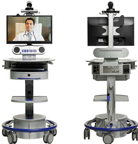
Figure 1. Cisco TelePresence VX Clinical Assistant