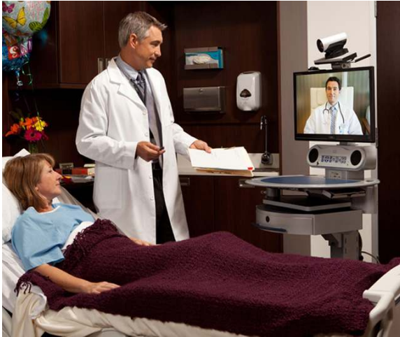
Figure 2. Cisco TelePresence VX Clinical Assistant