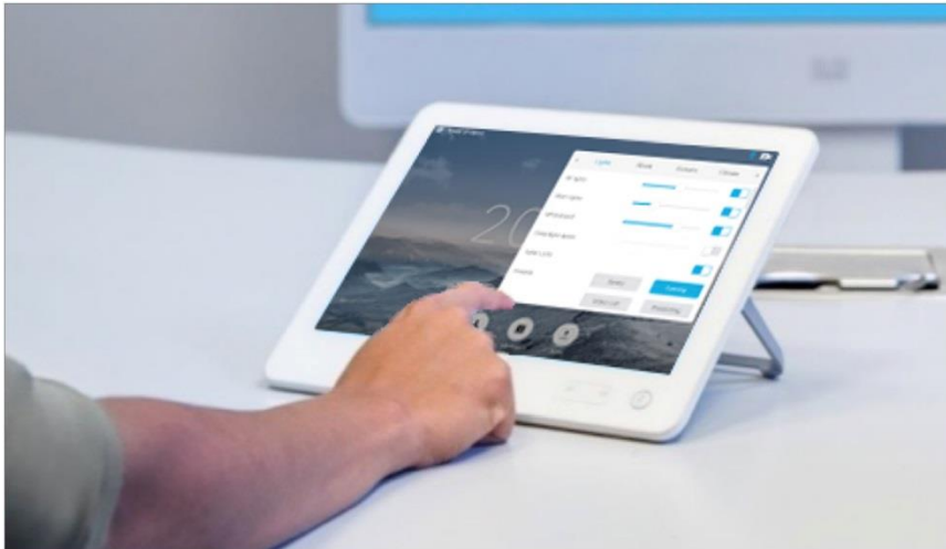
Figure 2. User Interface Displaying In-room Control Information

Table 1 gives specifications of the Cisco Touch 10 control unit.