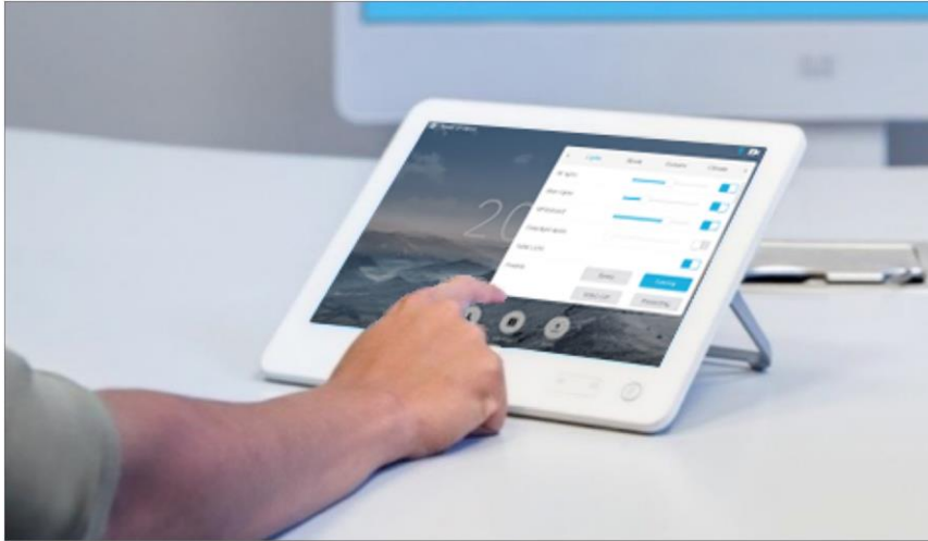
Figure 2. User Interface Displaying Room Control Information

Table 1 gives specifications of the Cisco TelePresence Touch devices.