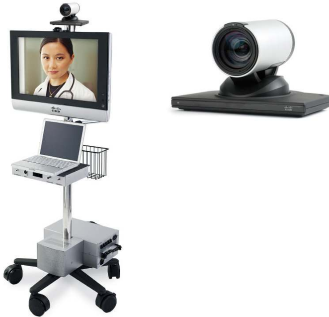
Figure 1. Cisco TelePresence System Intern MXP and Cisco TelePresence PrecisionHD Camera

The Cisco TelePresence® portfolio creates an immersive, face-to-face experience over the network—empowering you to collaborate with others like never before. Through a powerful combination of technologies and design that allows you and remote participants to feel as if you are all in the same room, the Cisco TelePresence portfolio has the potential to provide great productivity benefits and transform your business. Many organizations are already using it to control costs, make decisions faster, improve customer intimacy, scale scarce resources, and speed products to market.