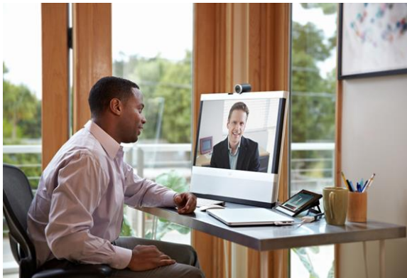
Figure 1. Cisco TelePresence EX90 in Home Office