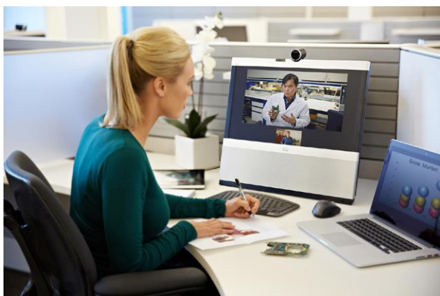
Figure 3. Cisco TelePresence EX60 in Ad-hoc Conference Call

The EX Series is part of the broad Cisco TelePresence System portfolio offering immersive, multipurpose, and personal endpoints to meet the needs of organizations of all sizes. Cisco TelePresence technology powers the new way of working in which everyone everywhere can be more productive through face-to-face collaboration (Figures 1, 2, and 3).