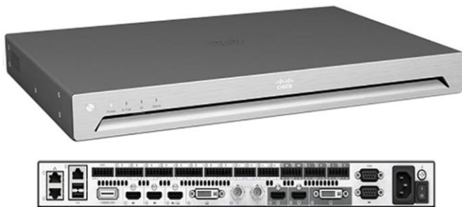
Figure 1. Cisco SX80 Codec