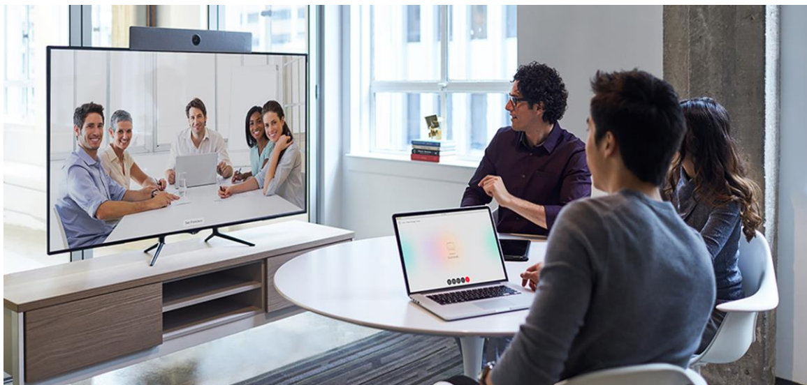
Figure 1. Cisco Webex Room Kit in small room scenario

The Room Kit – which includes camera, codec, speakers, and microphones integrated in a single device – is ideal for rooms that seat up to seven people. It offers sophisticated camera technologies that bring speaker-tracking capabilities to smaller rooms. The product is rich in functionality and experience but is priced and designed to be easily scalable to all of your small conference rooms and spaces – whether registered on the premises or to Cisco Webex.