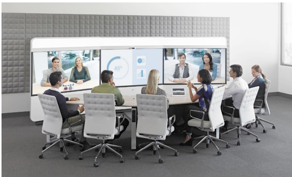
Figure 1. Cisco TelePresence IX5000, Six-Seat System

This sleek and powerful system incorporates an elegant triple 4K Ultra High Definition (UHD) camera cluster, three high-definition 70-inch LCD screens, and theater-quality audio to bring people together as if they were just across the table. The IX5000 Series includes the single-row, six-seat IX5000 system, and the dual-row, 18-seat IX5200 system.