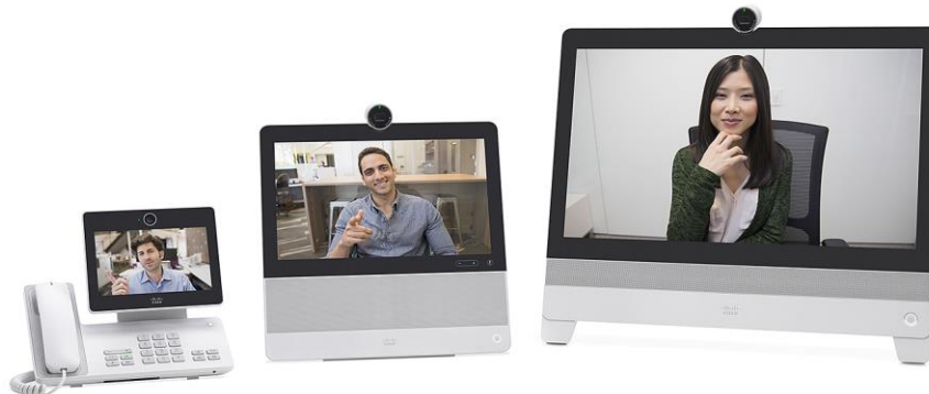
Figure 2. Cisco DX Series—DX650, DX70, and DX80

The Cisco DX Series (Figure 2) includes: