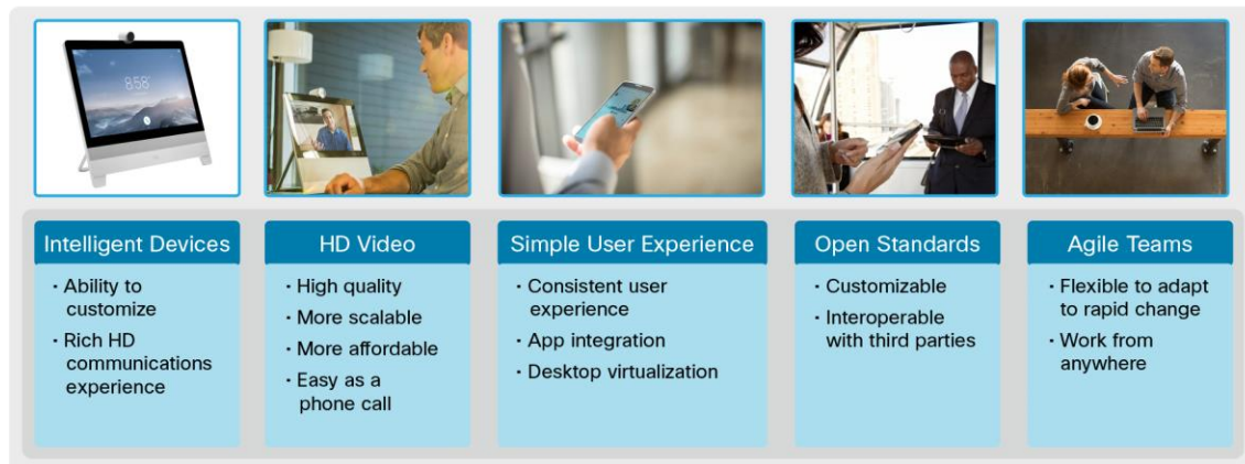
Figure 1. Evolving Trends That Are Shaping a New Era in Enterprise Communications

These factors and others are prompting companies to adopt collaboration solutions that go beyond basic voice communications and include an array of features and integration capabilities (Figure 1).