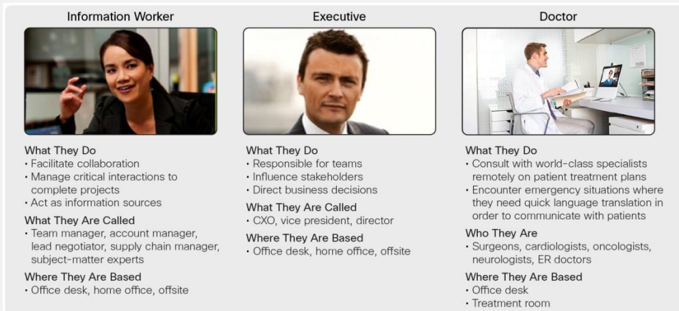
Figure 4. The Cisco DX Series Meets the Collaboration Needs of Different Roles

Figure 4 shows examples of some of the ways the Cisco DX Series can encourage dynamic collaboration: