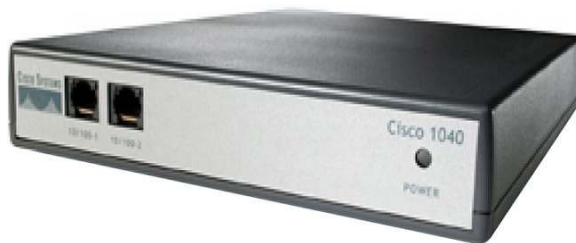
Figure 3. Cisco 1040 Sensor

Cisco 1040 Sensors, deployed close to the endpoint (IP phone, gateway, or voicemail system), monitor and evaluate call quality and report this information for active calls every 60 seconds, providing MOS exception alerts on calls in progress and reducing the sample time to help capture short-term impairment bursts. The Cisco 1040 Sensor, shown in Figure 3, collects RTP streams from a spanning port, obtains Power over Ethernet (PoE) through its connected device, and automatically finds USM in the network for easy field installations.