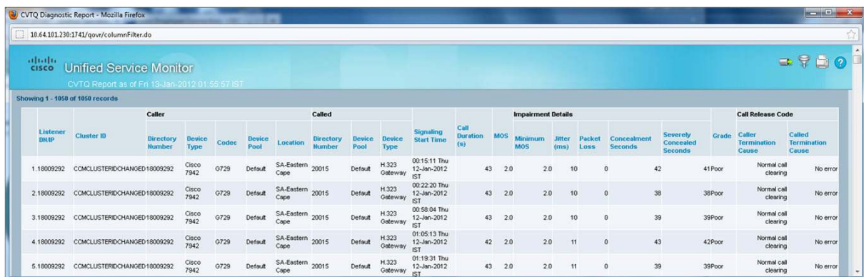
Figure 1. Voice Transmission Quality and Most Affected Endpoints Report

USM monitors, evaluates, and generates reports about user-experience metrics associated with active calls on the Cisco Unified Communications system. It provides a comprehensive list of voice-impairment metrics useful in troubleshooting voice-quality problems.