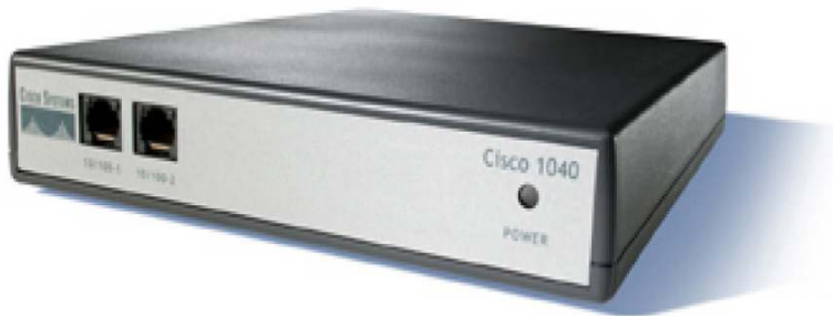
Figure 3. Cisco 1040 Sensor

Cisco 1040 Sensors, deployed close to the endpoint (IP phone, gateway, or voicemail system), monitor and evaluate call quality and report this information for active calls in near real time. The Cisco 1040 Sensor, shown in Figure 3, is a shelf-top unit that connects to the network and obtains Power over Ethernet (PoE) through a Cisco Catalyst® switch.