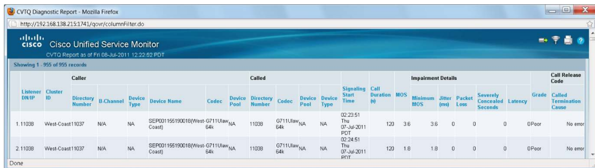
Figure 1. Cisco Unified Service Monitor: Voice Transmission Quality and Most Impacted Endpoints Report

Cisco Unified Service Monitor monitors, evaluates, and generates reports about user-experience metrics associated with active calls on the Cisco Unified Communications system. It provides a comprehensive list of voice-impairment metrics useful in troubleshooting voice-quality problems.