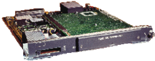
Figure 4. The Cisco Network Analysis Module

Table 1 lists the differences between Cisco 1040 Sensor and Cisco Network Analysis Module 4.0