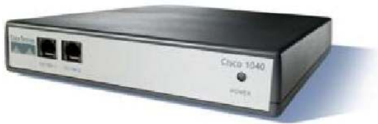
Figure 3. The Cisco 1040 Sensor