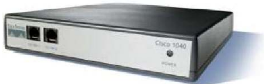
Figure 3. The Cisco 1040 Sensor