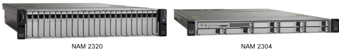
Figure 1. Cisco Prime NAM 2320 and NAM 2304 Appliances

The Cisco Prime NAM 2320 Appliance includes two 10 Gigabit Ethernet monitoring interfaces and sixteen 1 TB enterprise class Serial Advanced Technology Attachment (SATA II) hard disk drives with an option to upgrade to twenty-four drives at the time of ordering. The Cisco Prime NAM 2304 includes four 1 Gigabit Ethernet monitoring interfaces and eight 1 TB enterprise class SATA II hard disk drives.