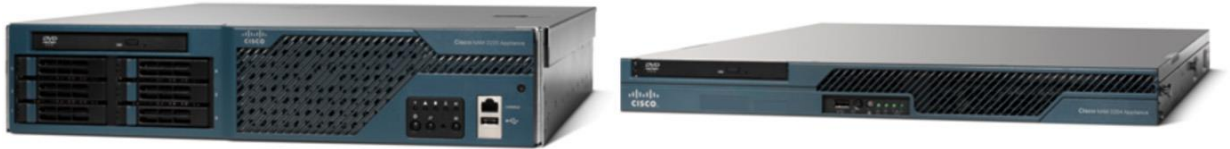
Figure 2. NAM 2220 and NAM 2204 Appliances

Cisco offers two appliances models (Figure 2), the Cisco NAM 2220 Appliance and the Cisco NAM 2204 Appliance. The Cisco NAM 2220 Appliance includes two 10 Gigabit Ethernet monitoring interfaces and six 146 GB Serial Attached SCSI (SAS) hard disk drives with RAID for application monitoring in high-speed, high-density environments. The Cisco NAM 2220 comes with an option for redundant power. To extend uptime, both the hard disk drives and the power supplies are hot-swappable. The Cisco NAM 2204 includes four 1 Gigabit Ethernet monitoring interfaces and two 250 GB Serial Advanced Technology Attachment (SATA) hard disk drives to meet diverse performance analysis needs in scalable multigigabit switching and routing environments.