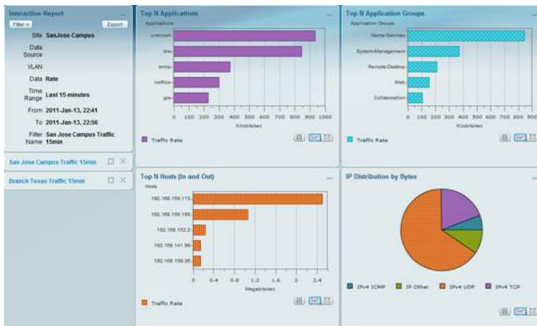
Figure 1. Cisco NAM Traffic Summary Dashboard

The Cisco NAM 2200 Series Appliances help you know. They are your source for unparalleled network and application visibility, analyzing traffic flows between users and their critical applications to help you ensure that the network performs to the rigorous demands of the business. And, when there's a problem, they can help you find it fast, reducing the time it takes to resolve it from days to just minutes.