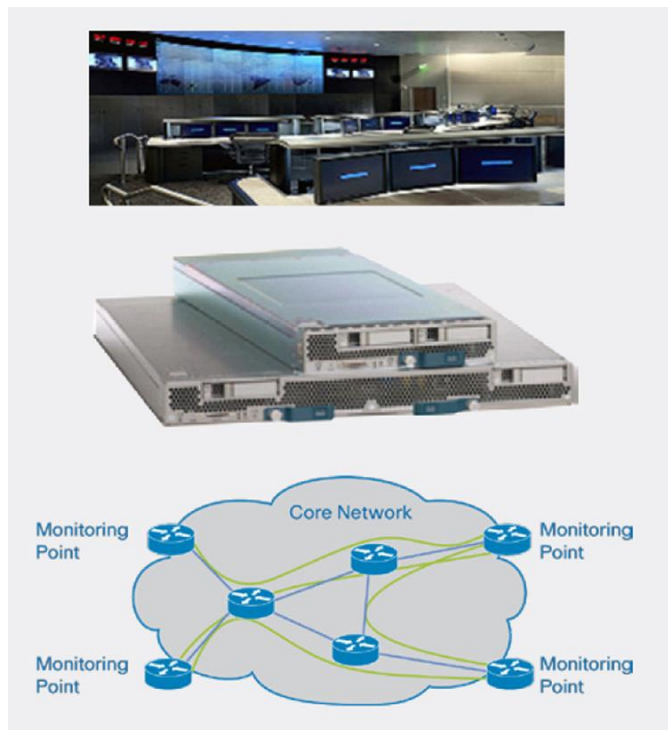
Figure 1. Easily Add Network Management to Cisco ASR 9000 and ASR 1000 Series Architectures