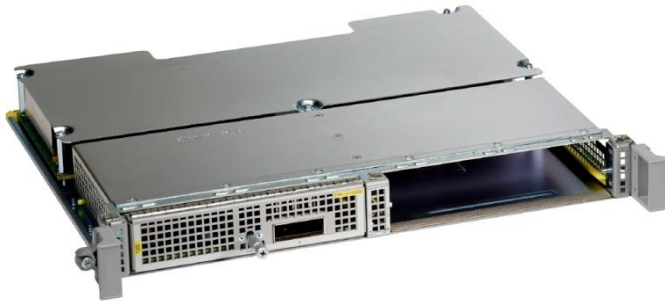
Figure 4. Cisco ASR 1000 Series 1-port 100 Gigabit Ethernet port adapter