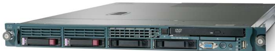
Figure 1. Cisco ACE XML Gateway

XML-based services require outstanding throughput to support today's complex integrated application systems. The Cisco ACE XML Gateway delivers industry-leading performance exceeding 30,000 transactions per second (TPS). All-in-memory processing and store-and-forward processing modes help ensure that XML messages of all sizes can be processed without compromising security, interoperability, or system reliability. The result is exceptionally secure, efficient, and flexible XML message processing performance, end to end. The dramatic performance improvements afforded by the Cisco appliance helps eliminate the barriers to deployment of Web services.