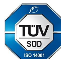
Michael Fernald Head of Central Certification Body Page 1 of 4

The certificate is valid from January 31, 2026 until January 30, 2029 With a re-issue date on N/A