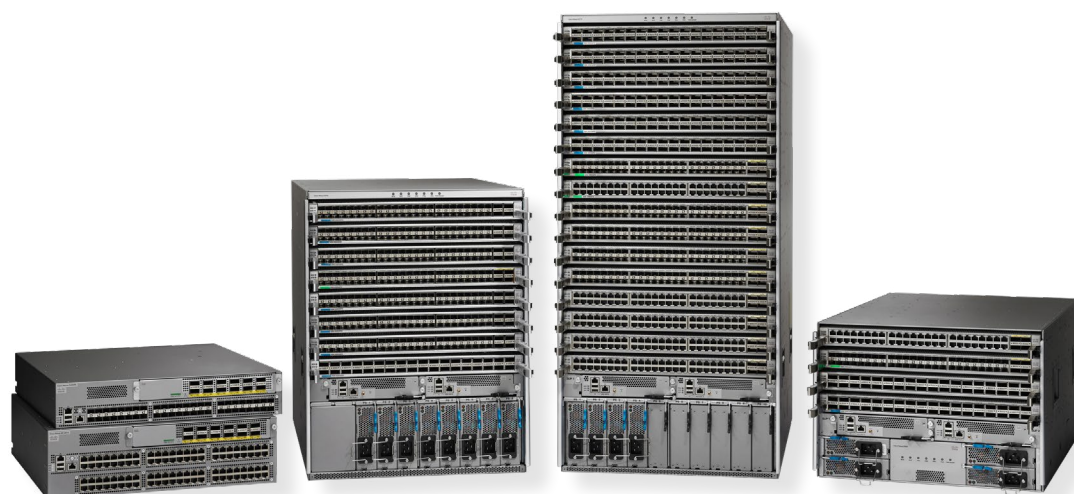
Cisco Nexus 9000 Series Switches: Open and programmable, operating in either Cisco NX-OS or Cisco ACI mode.

Start with the industry leading switch for programmability, automation and SDN